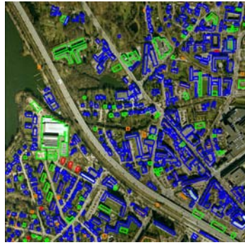
(b) Rottensteiner (2008)