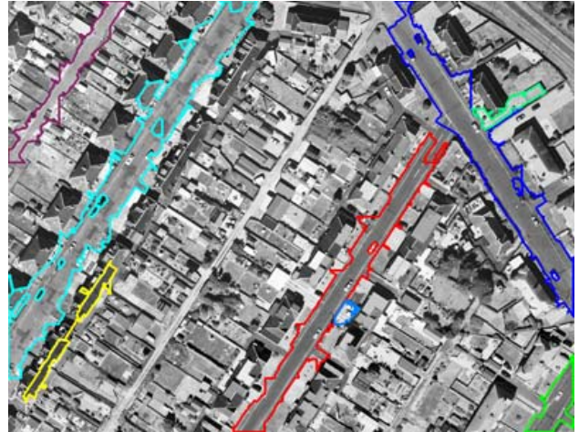
Figure 8. Extraction result on third subset.

In these examples the majority of the roads are covered by extracted road parts. There are few false positives, and those are mainly small and could be eliminated in a later step. In summary, also considering subsets that are not shown here, 60-70% of the roads are found.