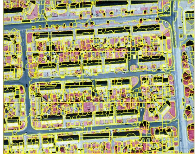
Figure 4. Grouping result.

The next step is the evaluation of the segments to extract road parts after large segments (over 200 m 2 ) have been split. In order to speed up the computation, only large segments are considered for splitting. Small segments can be ignored because the splitting is done only at junctions with branches longer than 10 m. The segments that were extracted as road parts are shown in Fig. 5.