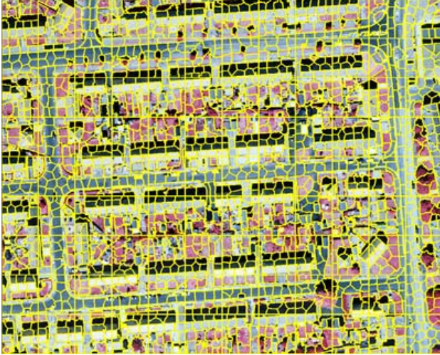
Figure 3. Segmentation with normalized cuts.

For the segmentation the image has to be divided into subsets for computational reasons. The size of the subsets is approximately 200 x 200 pixels. Each subset is divided into 20 segments. Fig. 3 shows a segmentation example.