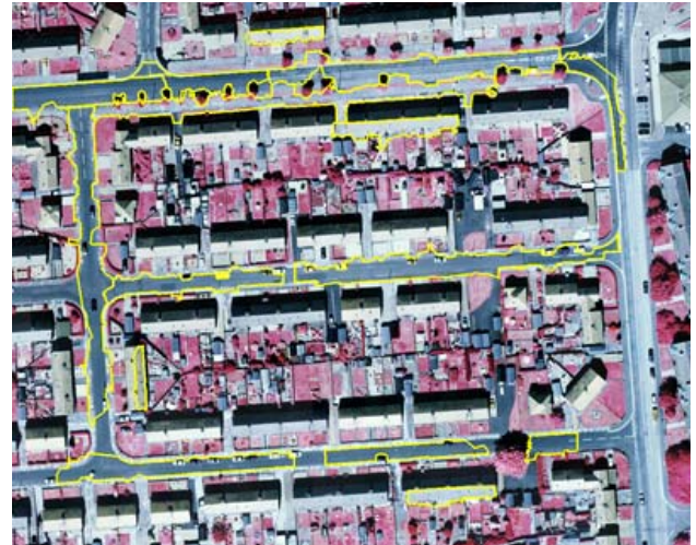
Figure 5. Road part extraction result.

The next step is the evaluation of the segments to extract road parts after large segments (over 200 m 2 ) have been split. In order to speed up the computation, only large segments are considered for splitting. Small segments can be ignored because the splitting is done only at junctions with branches longer than 10 m. The segments that were extracted as road parts are shown in Fig. 5.