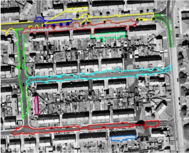
Figure 6. Assembled road parts. Connections between road parts are shown as lines in the same colour. Intensity image used for clarity of display.

Road parts that lie on the same road have generally been found. In the case of the group of road parts displayed in yellow, at the top of the image, two road parts were connected to the same end of the first road part. This branching is permitted so that no road hypotheses are lost. In a later step both alternatives will be examined and the better one will be kept. The blue road part between the yellow ones was not added to the group because of the overlap with the left yellow one.