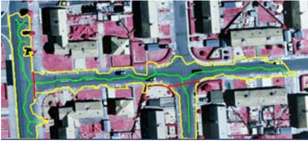
Figure 1. Partition of large segment. Original segment borders in yellow, skeleton in green, dividing lines in red.

secondary direction. Then for each branch that belongs to the secondary direction it is determined at which point the branch should be separated from the region. For this purpose, a line whose length equals the average road width and whose orientation is perpendicular to the secondary direction is moved along the secondary branch. The first place where the line intersects with the borders of the region on both sides of the skeleton branch is the place where the region is divided. After all branches have been examined, a second step follows in which the region is divided at places where the skeleton of the smoothed segment was disconnected due to the smoothing operation. Fig. 1 shows how one segment is partitioned.