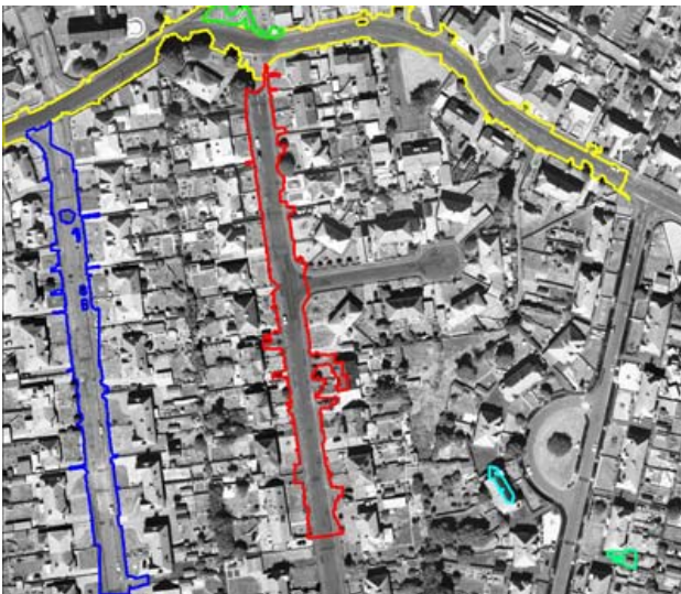
Figure 7. Extraction result on second subset.

The figures 7 and 8 show the results of two further subset images. Here the roads were typically covered as a whole by one road part so that the assembling step had no effect.